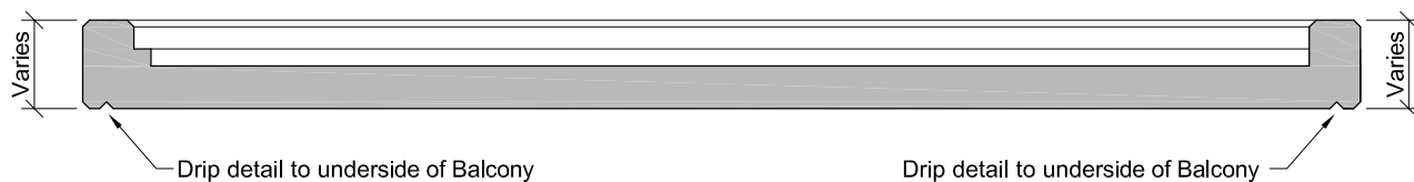
Section along Channel